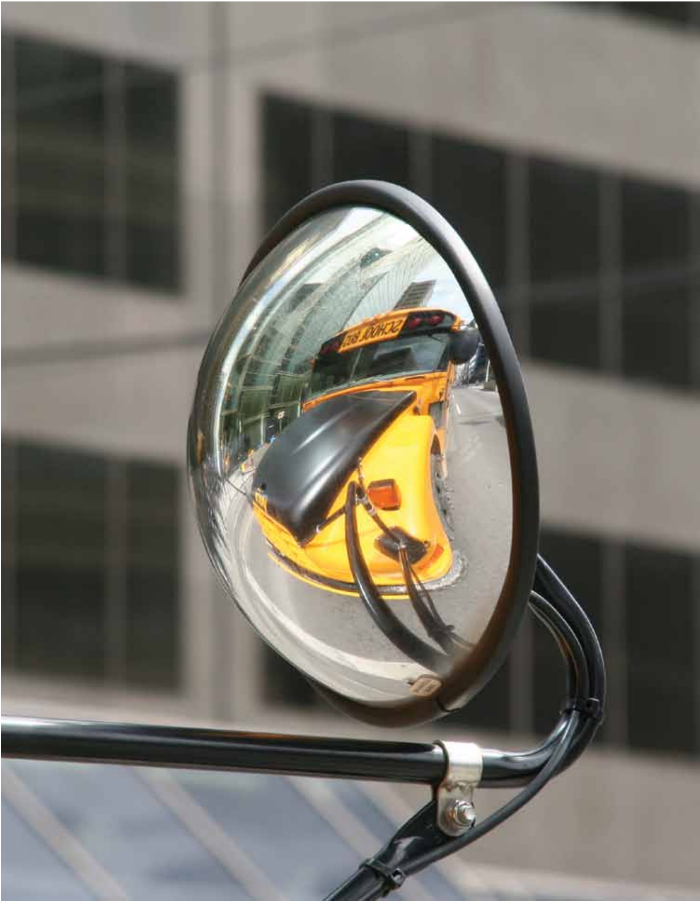
Unit 5: Chapter 3