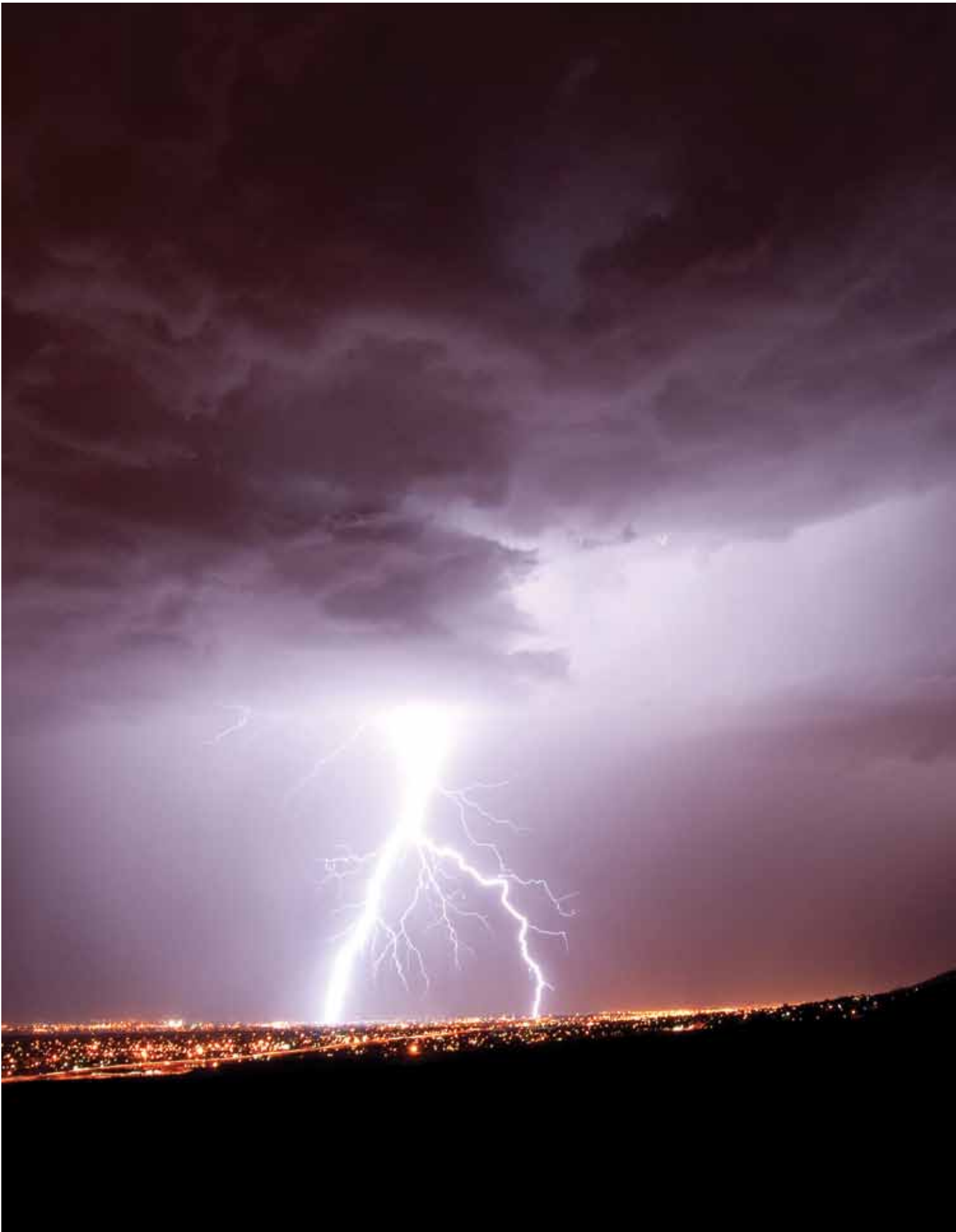
Unit 5: Chapter 6