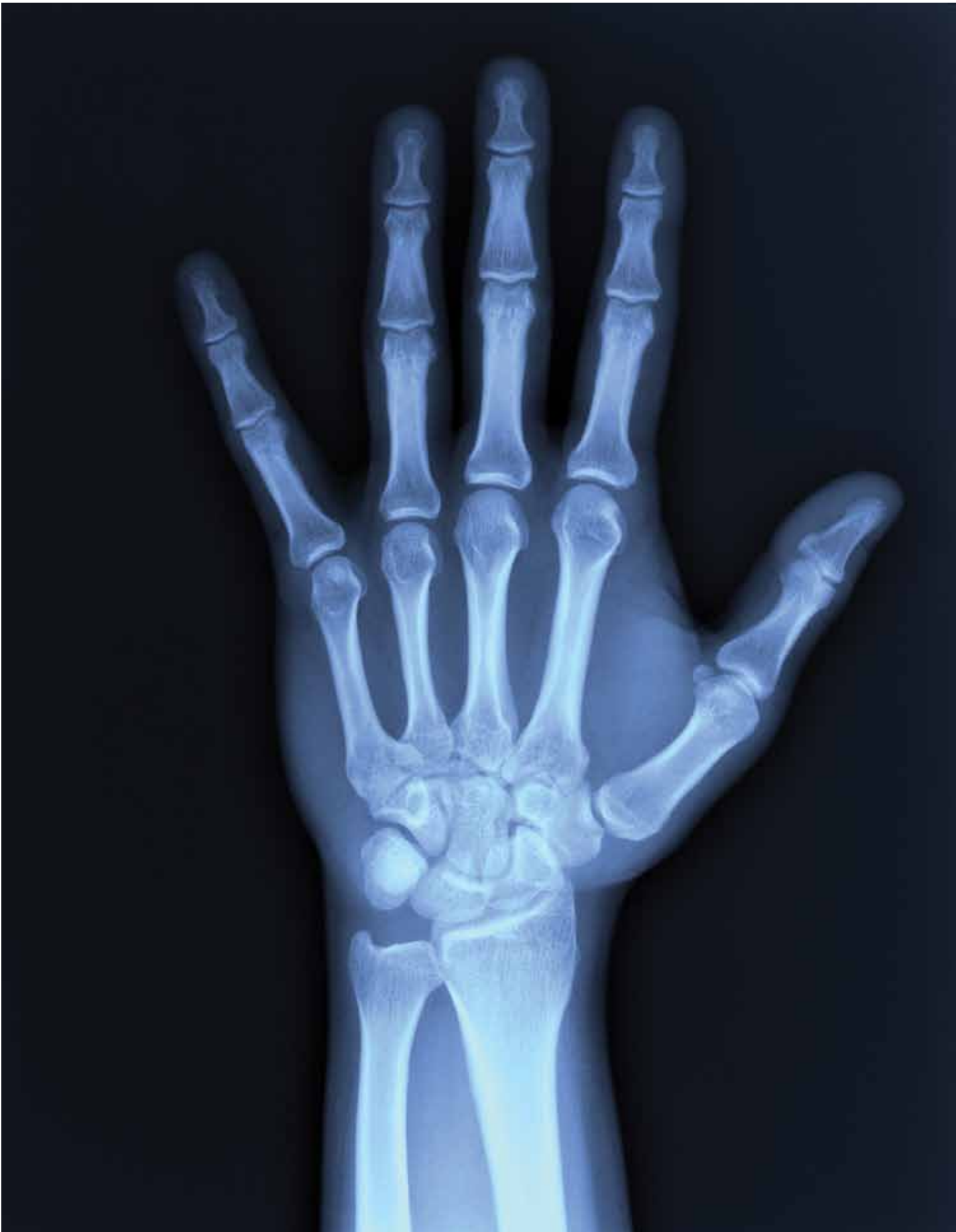
Unit 5: Chapter 5