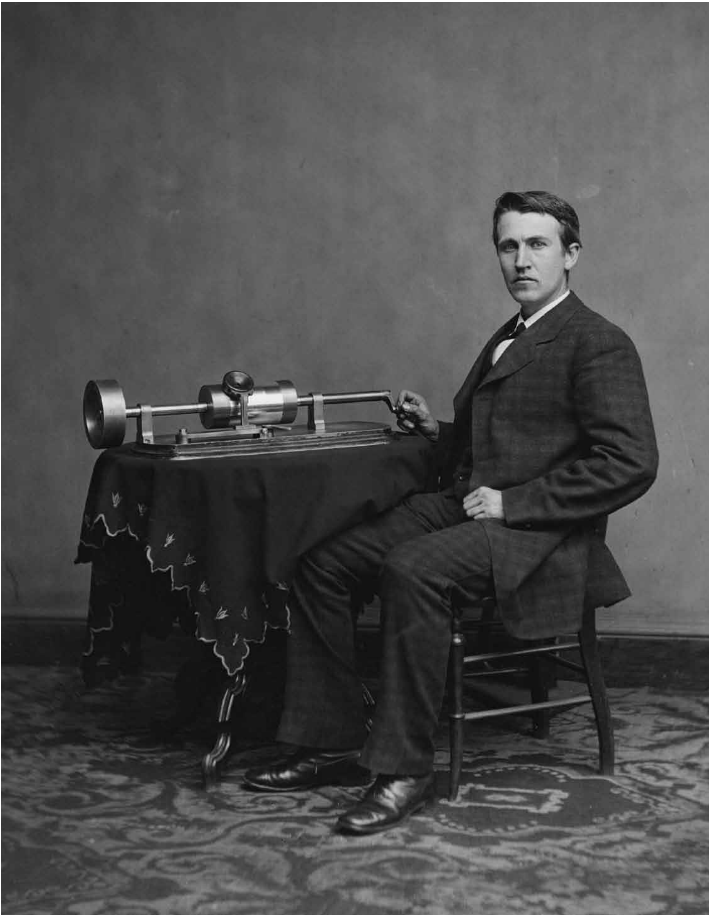
Unit 5: Chapter 12