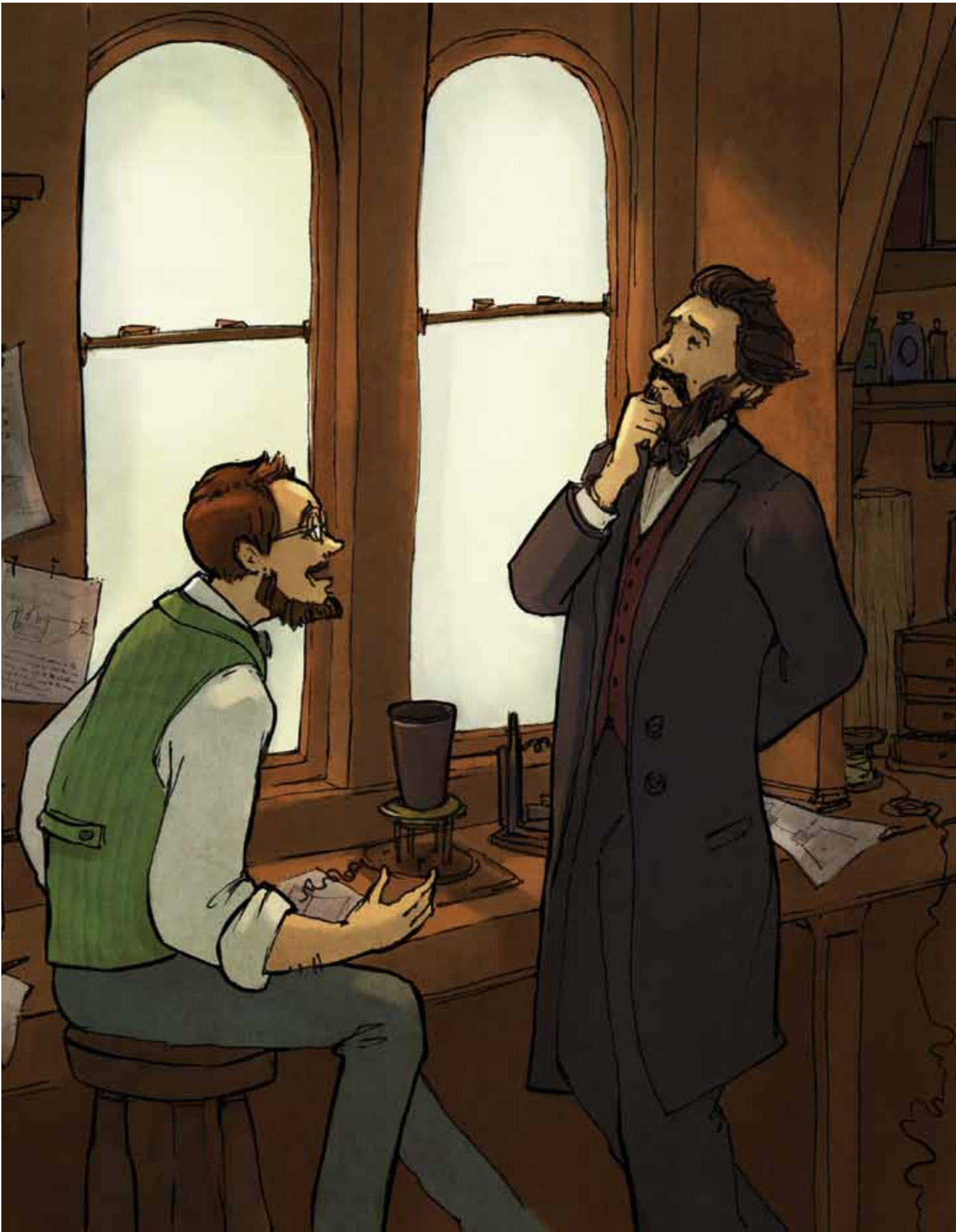
Unit 5: Chapter 11