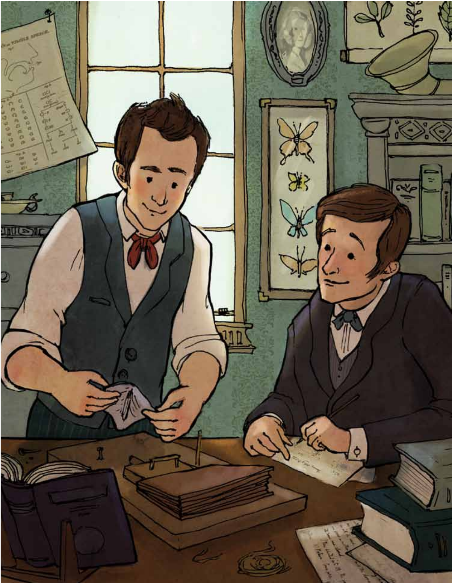
Unit 5: Chapter 10